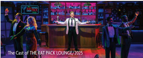
The Cast of THE RAT PACK LOUNGE/2025