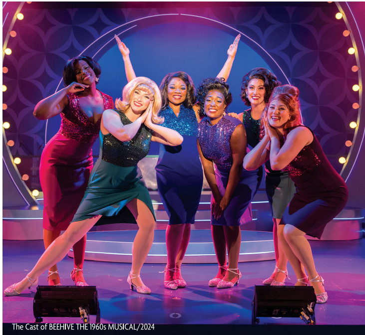
The Cast of BEEHIVE THE 1960s MUSICAL/2024

We hold true to our mission to "improve the quality of life in our community through the arts." We continue to set the bar high. Our staff works with groups of all sizes to make sure they have the best outing possible.