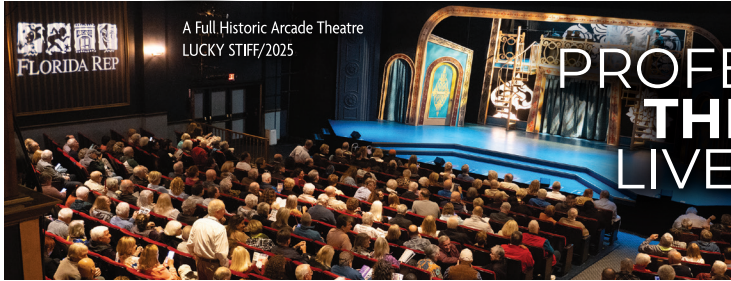
A Full Historic Arcade Theatre LUCKY STIFF/2025